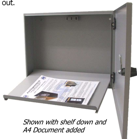
Shown with shelf down and A4 Document added