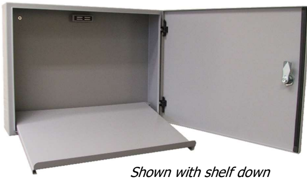
Shown with shelf down